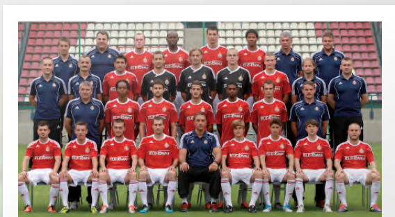
Wisła Kraków - Ekstraklasa's 2010/2011 Champion

More games (unilateral) available on request