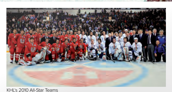
KHL's 2010 All-Star Teams